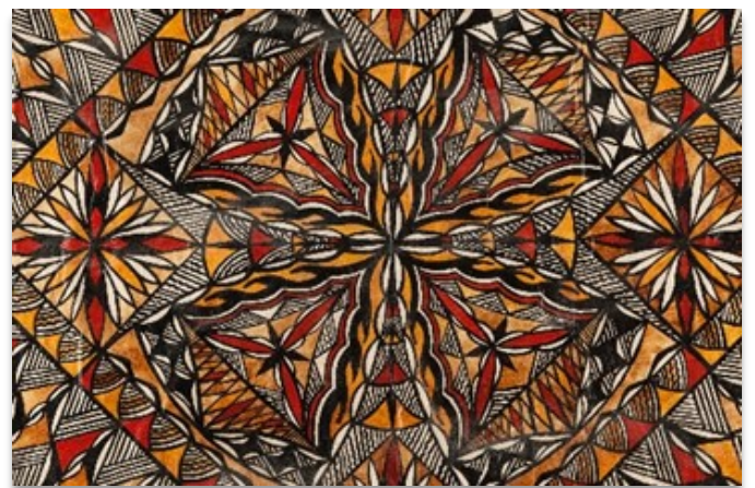
Image: Oceanic art from the collection of Denver Museum, USA

Your silence is full, irresistible; Your presence is joy, unspeakable. People drifting into mind We lift to you and pray they find health in holiness life in deadness strength in weakness light in darkness. Their loss you bear, mysteriously your peace they share, eternally.