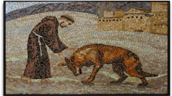
Image from website of First Congregational Church, Winchester, Maine, USA : https://fcc-winchester.com/latest-news/the-story-of-the-wolf-of-gubbio-and-st-francis-of-assisi/

After that the wolf wandered freely around Gubbio, being fed properly and even entering people's homes. The citizens began to love and respect him and he was content, his hunger assuaged. Perhaps not only hunger for food, but his hunger to be accepted and loved. After two years the wolf died, to great