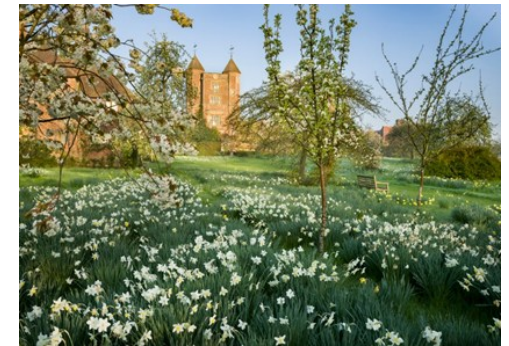
Sissinghurst Castle Garden in April

In 'The Garden', her final book of poetry published in 1946, the writer (and gardener) Vita Sackville West famously described April as 'the angel of the months, the young love of the year.' It's an arresting representation. And it's certainly a lot more complementary than the opinion of many who in various online surveys seem to regard April as 'fair to middling'... 'neither one thing nor the other'.