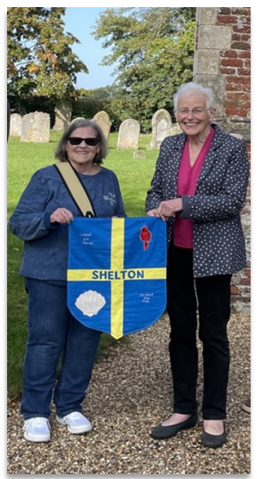
Presentation of the Kentucky Shelton quilt