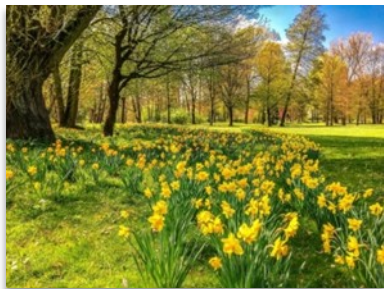
The Lent Lily - a wild daffodil

The 31 days of March offer us many different things to enjoy: