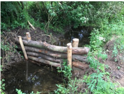
Example of a leaky dam

The Environment Agency, Norfolk County Council and Hempnall Parish Council are currently exploring opportunities to help ‘slow the flow’ above Hempnall village. Slowing the downstream transportation of water during peak rainfall events can help reduce flooding to people and properties. Measures that can help ‘slow the flow’ include simple actions such as tree planting on hillslopes and along watercourses to help intercept overland runoff. Other measures include allowing water to be stored temporarily in low spots where the ground often sits wet and adding leaky dams to watercourses and ditches to physically hold water up behind them. Slowing these flow pathways to benefit communities at risk of flooding downstream is called Natural Flood Management. For more information contact helen.george@environment-agency.gov.uk Helen will be joining the Property Flood Resilience “Flood Mobile” in Hempnall Village Hall car park on Wednesday 30 th March.