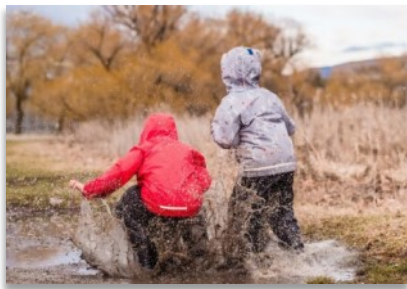
The best mud puddles!