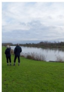
12 Circular walks in South Norfolk