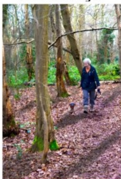
Circular walks in south Norfolk