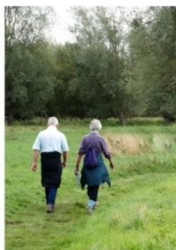
Circular walks in south Norfolk

We have 3 walk books available, at £3 each, from our churches or the church office, 01508 498157.