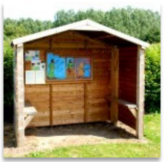
The Ditchingham way-station on the Via Beata

A national charity which supports people to work their way out of homelessness and has a local base in Ditchingham.