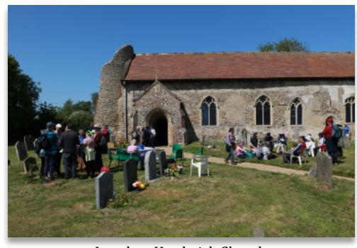
Lunch at Hardwick Church

The groups arrived by degrees in Hardwick churchyard where they were revitalised with drinks and enjoyed the opportunity to sit and chat in the sunshine. After lunch the walk continued through Tyrrell's Wood and across the busy Ipswich Road to Great Moulton for a joyful service.