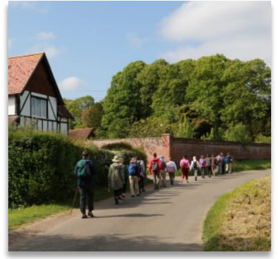
Setting off from Ditchingham

Along it can be found a series of exceptionally beautiful and evocative artifacts conceived and created by Stephen Eggleton, a talented South Norfolk craftsman. Each of these has a religious connotation and they stand at regular intervals as way stations which are then linked by paths and quiet roads.