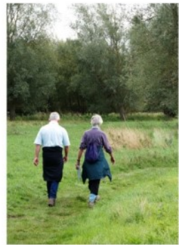
Circular walks in south Norfolk

We have 3 walk books available, at £3 each, from our churches or the church office, 01508 498157.