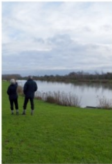
12 Circular walks in South Norfolk