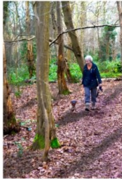
Circular walks in south Norfolk