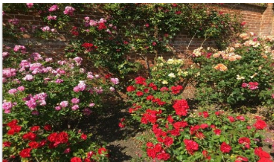
Mannington Hall Heritage Rose Garden, Norfolk

As we pass 2024's longest day (even though we may feel summer has barely arrived this year), our gardens are in full swing, lush, colourful, with everything growing apace following the cooler and wetter conditions of earlier months. What will happen next?