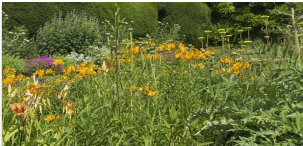
The garden of The Bishop's House, Cathedral Close, Norwich, often open in support of local charities.

Co-Chairs of the Joint Council of the Hempnall Group of Parishes