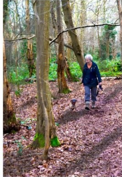
Circular walks in south Norfolk