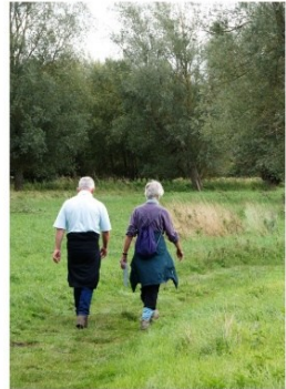
Circular walks in south Norfolk

We have 3 walk books available, at £3 each, from our churches or the church office, 01508 498157.