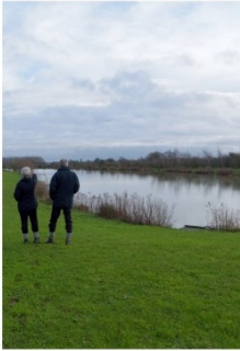
12 Circular walks in South Norfolk