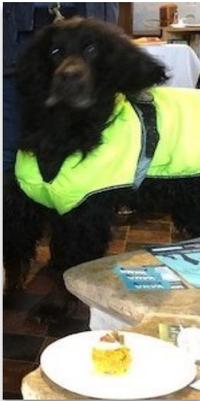
Now you see it.....