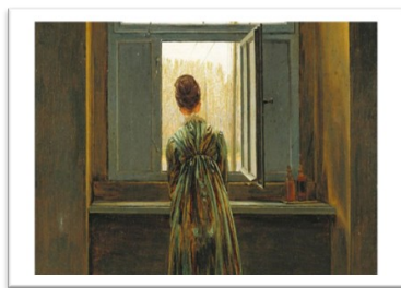
Woman at a Window by Caspar David Friedrich (1822)

Sameness is comforting even for the restless spirit; each day is a new start and there is that moment when we open the curtains to see what the weather is like and wonder what the new day will bring.