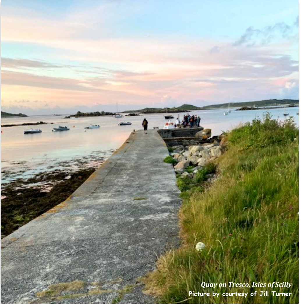
Quay on Tresco, Isles of Scilly

Produced by The Hemphall Group of Parishes