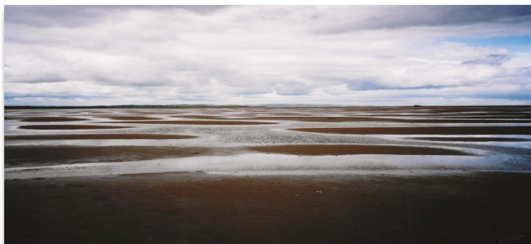
Photograph taken on Hempnall Group Pilgrimage, Lindisfarne, 2007